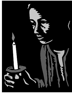
I was blind and now I see

The Saviour himself intones the theme of this meditation: 'I am the light of the world'. The powerful symbolism of light often finds expression in the Scriptures. It is often appealed to in the Psalms, the confession of faith of the ordinary people in old Israel – God's Word is 'a light on the path' of life (Ps 119); Yahweh himself is Israel's 'light and salvation' (Ps 27). The contrast between light and darkness is often appealed to in the New Testament, as in today's reading from Ephesians.