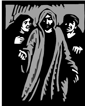
They recognised him in the breaking of the bread

In the joy and wonder of their new-found faith, the two disciples 'set out that instant' to rejoin 'the Eleven and their companions' in Jerusalem. It is in a vital Christian community that we will find the support and confirmation we need in our journey of faith.