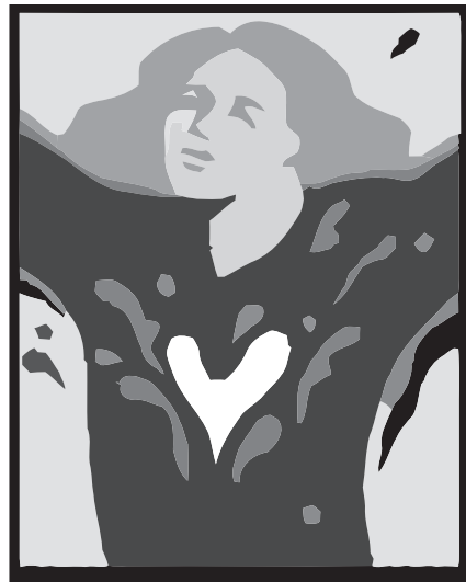
He will baptize you with the Holy Spirit and with fire