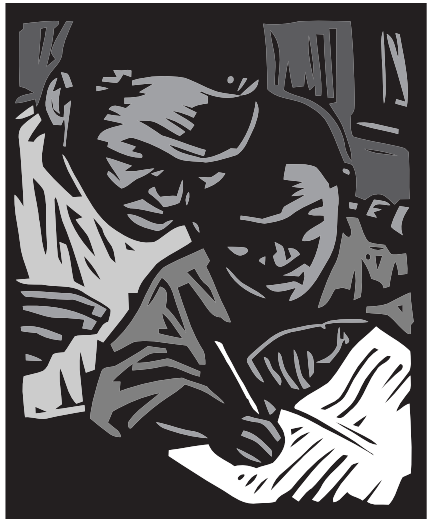
No prophet is ever accepted in his own country

The theme of today's liturgy is the role of the prophet. Prophets have always had an important place in the life of the Church. This comes as a surprise to most people – probably because they think of prophets as those who predict future events: something that rarely happened. Prophets are people who – because they are in tune with God – help us to see things as God sees them. They point out the way God is calling us to follow, and remind us of the future God has in store for those who trust in him. At Vatican II, it was recognized that the important contribution such people can make has been neglected in the life of the Church in recent centuries. Every healthy Christian community has its prophets; we should be grateful for them and open to what they have to contribute to our life together. As Vatican II has told us, we are all called - through our baptism - to share in Christ's role as the Father's great Prophet.