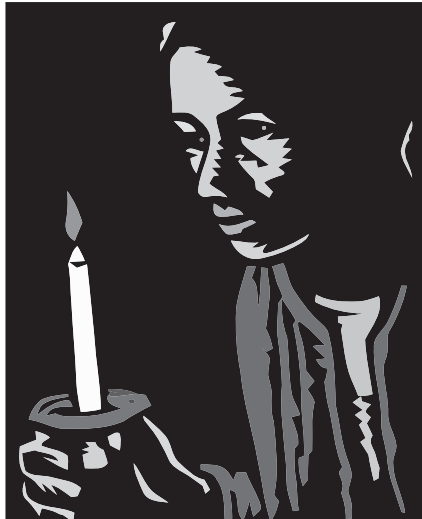
I was blind and now I see

The Saviour himself intones the theme of this meditation: 'I am the light of the world'. The powerful symbolism of light often finds expression in the Scriptures. It is often appealed to in the Psalms, the confession of faith of the ordinary people in old Israel – God's Word is 'a light on the path' of life (Ps 119); Yahweh himself is Israel's 'light and salvation' (Ps 27). The contrast between light and darkness is often appealed to in the New Testament, as in today's reading from Ephesians.